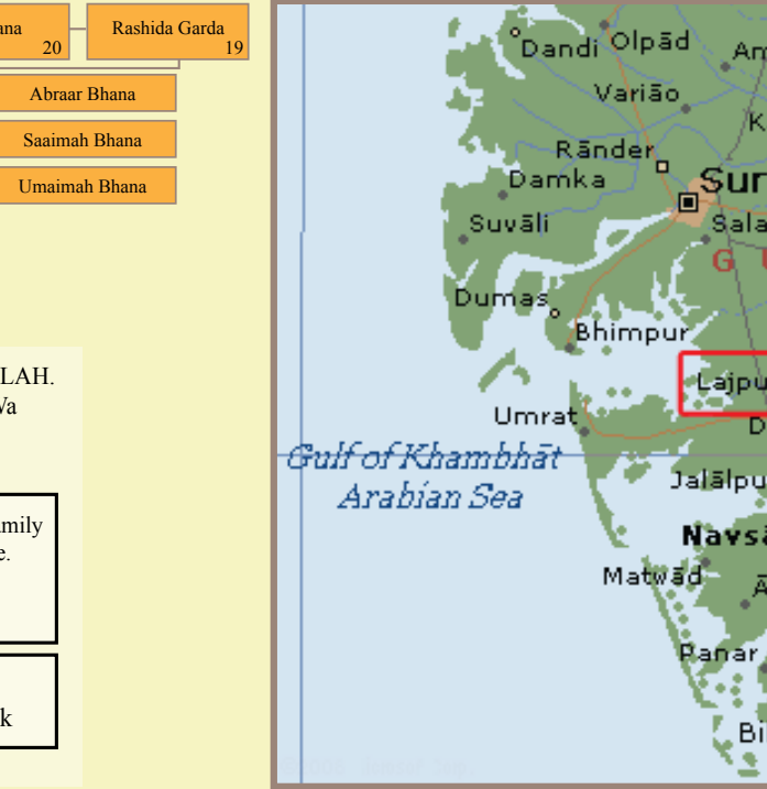
Gulf of Khambhat Arabian Sea